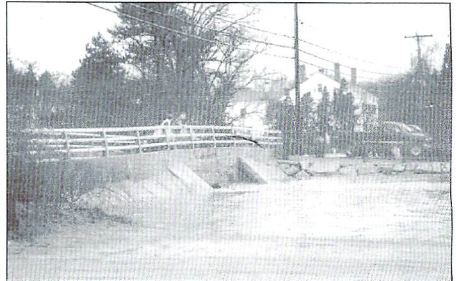
Residents watch as the tide continues to rise.